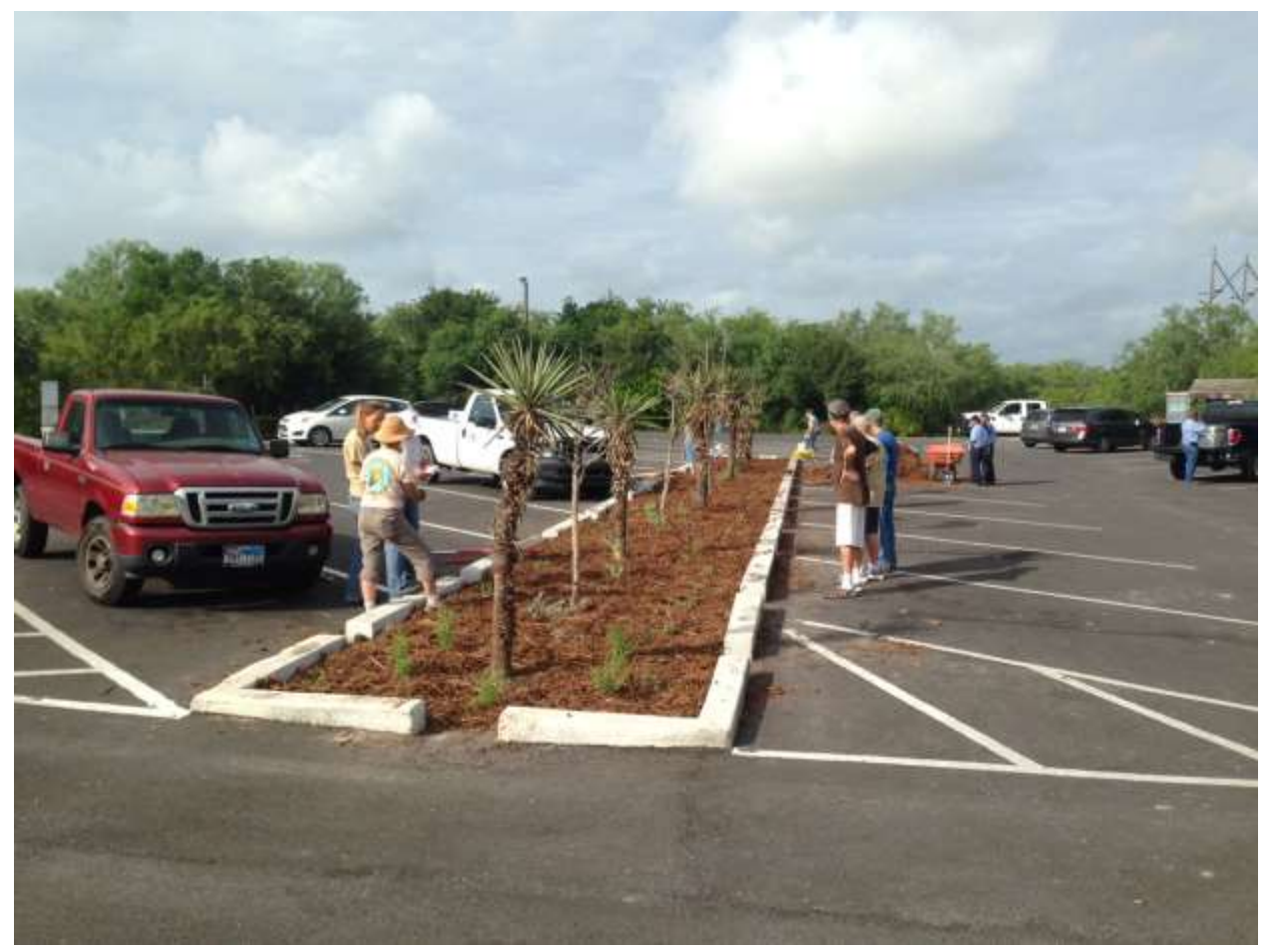
Planting of the Bio-retention Basin complete.