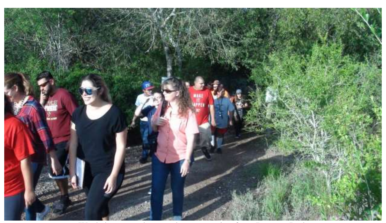
Workshop complete, students emerging from Ramsey Park