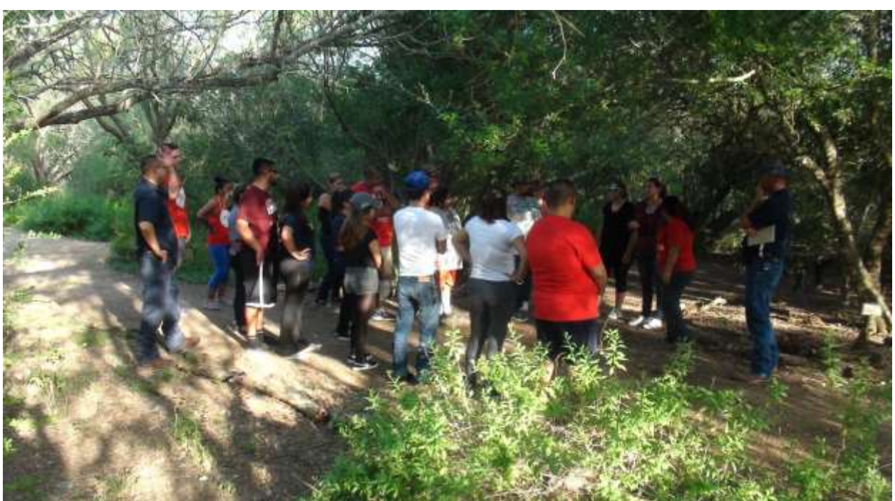
Wrapping up the workshop, final thoughts and questions from the students