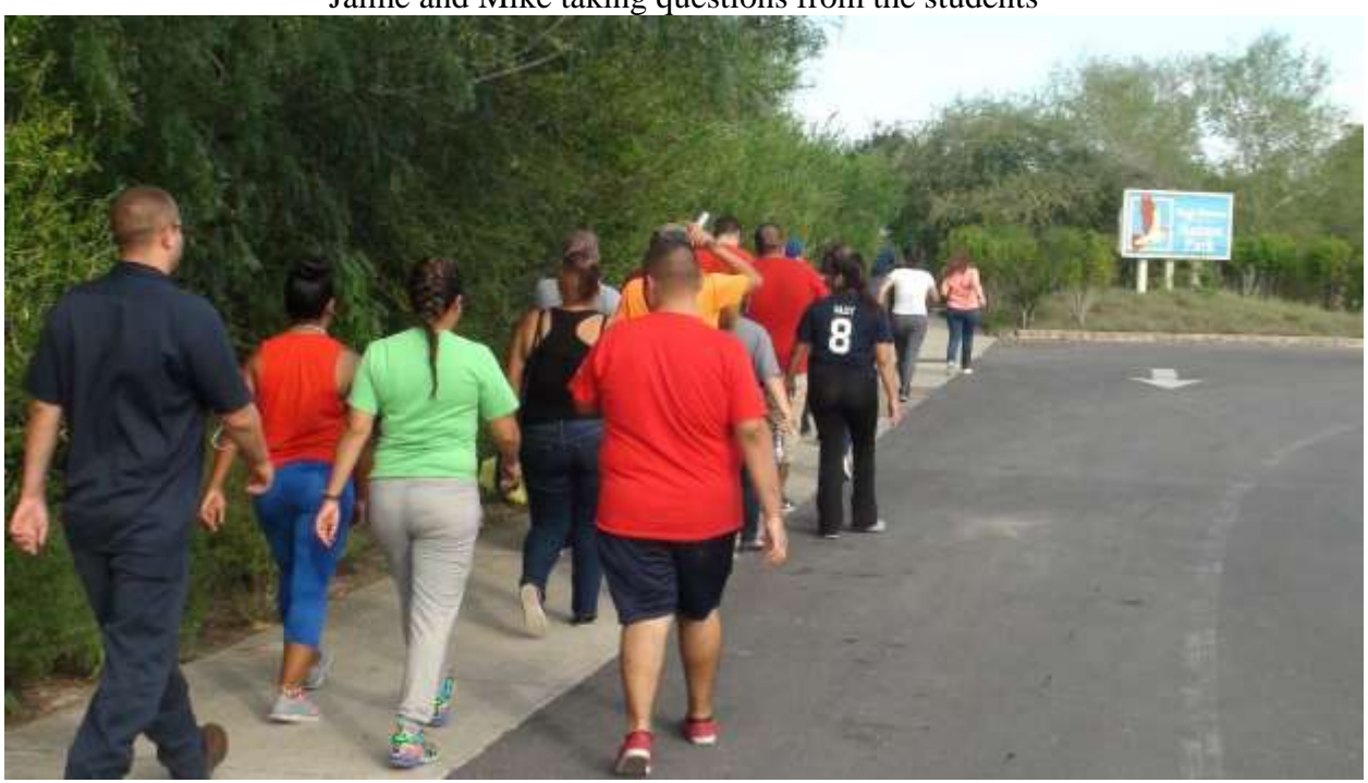
Leading the students into the park to view the wetlands