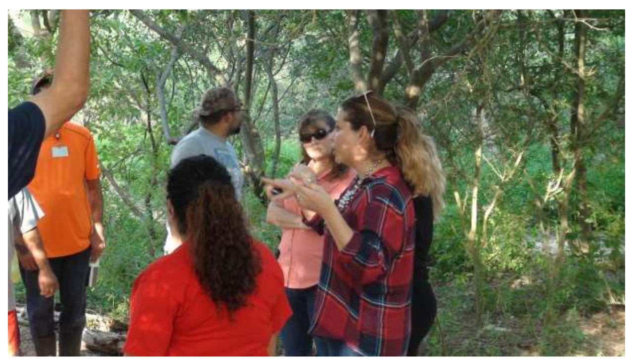
TSTC Staff addressing student questions