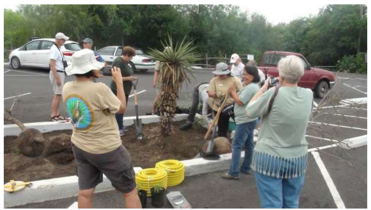
First Spanish Dagger planted.