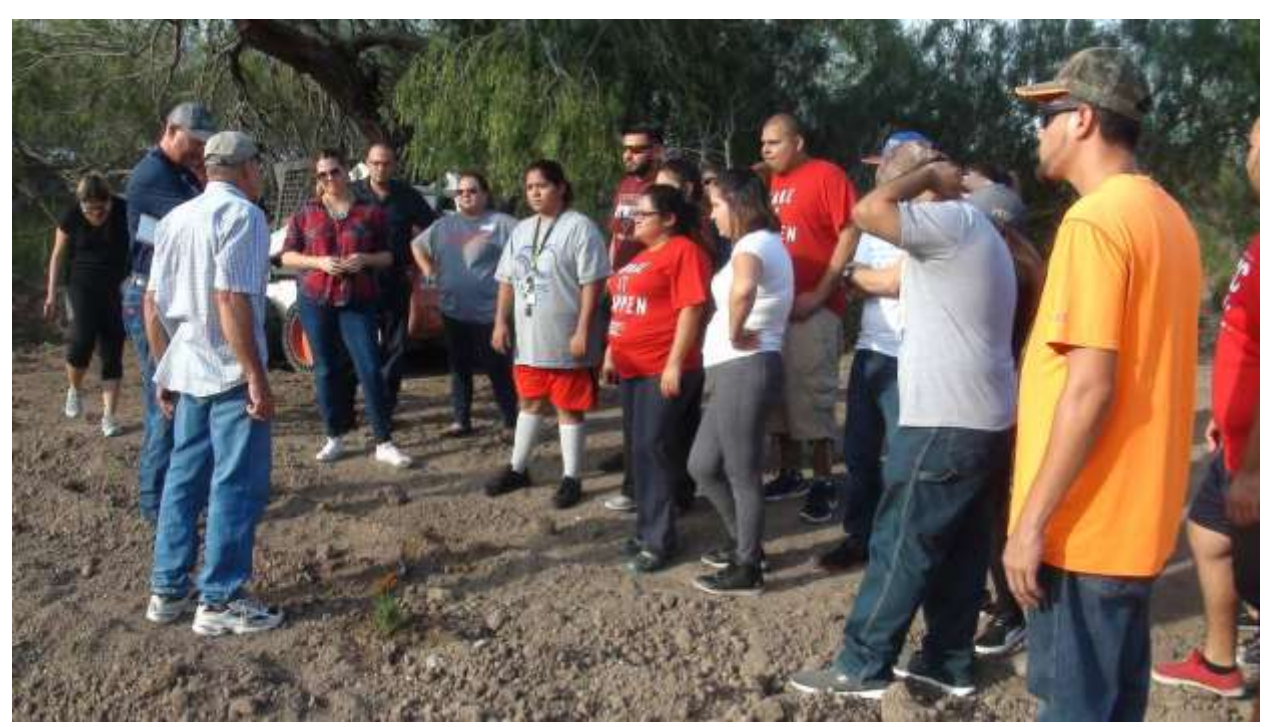
Discussing coordination and team leadership