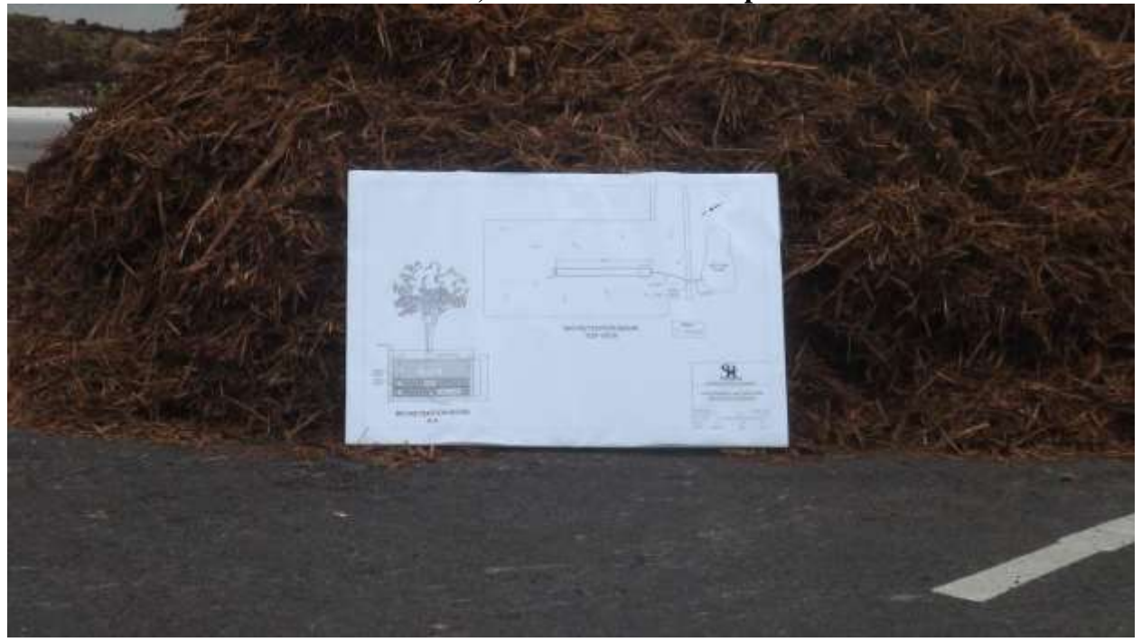
Plan view and cross-section view of the Bio-retention basin.