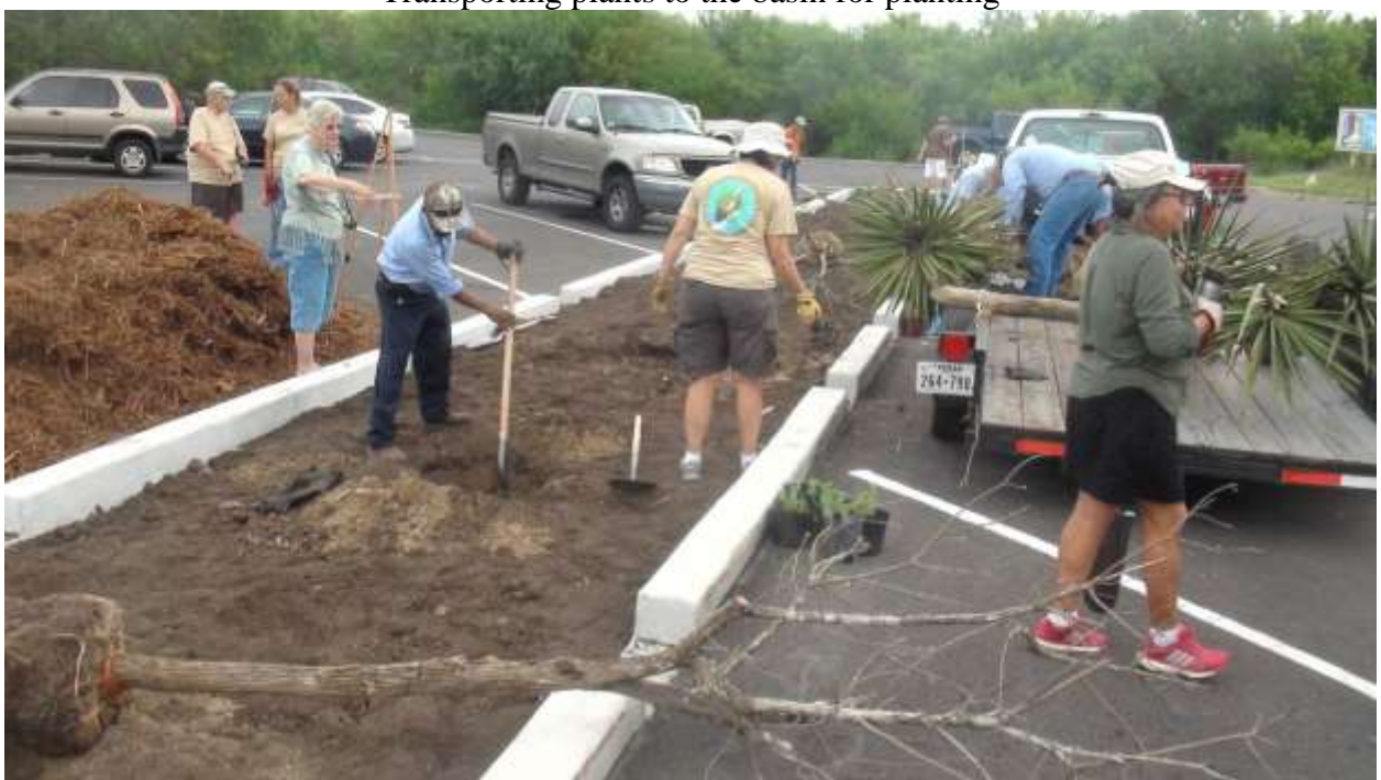
COH Staff helping transport and plant some of the larger trees