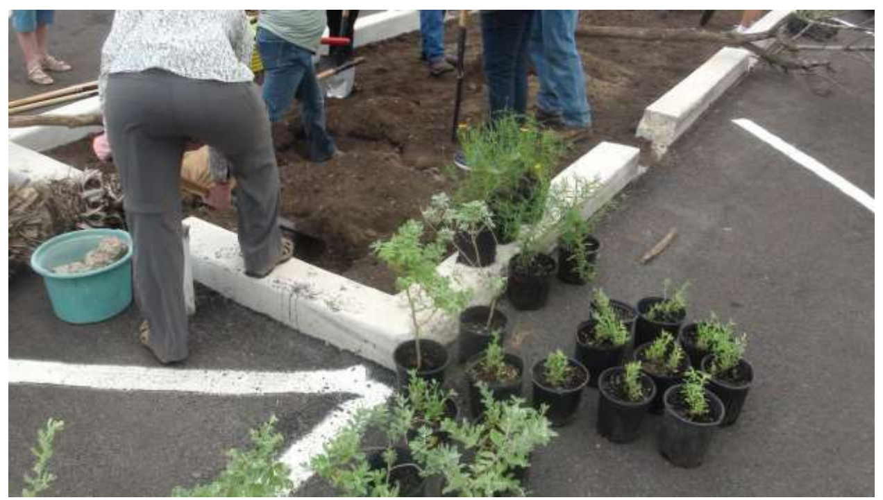
Transporting plants to the basin for planting