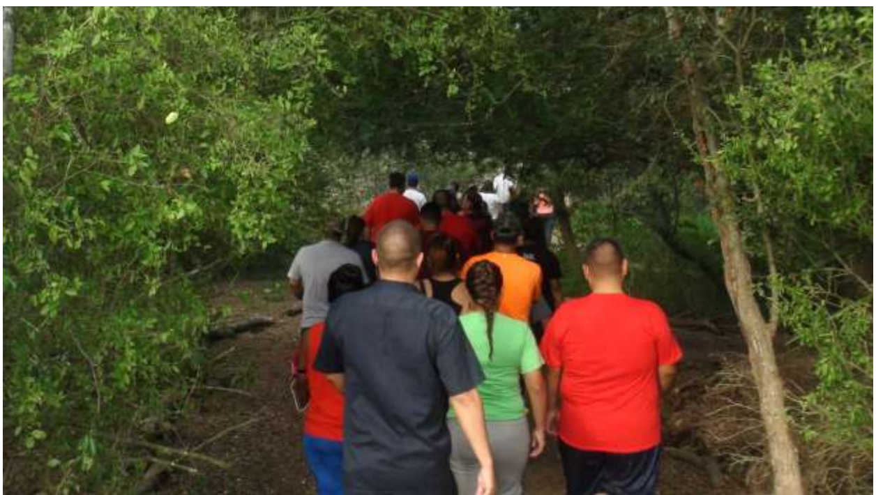
Entering the park