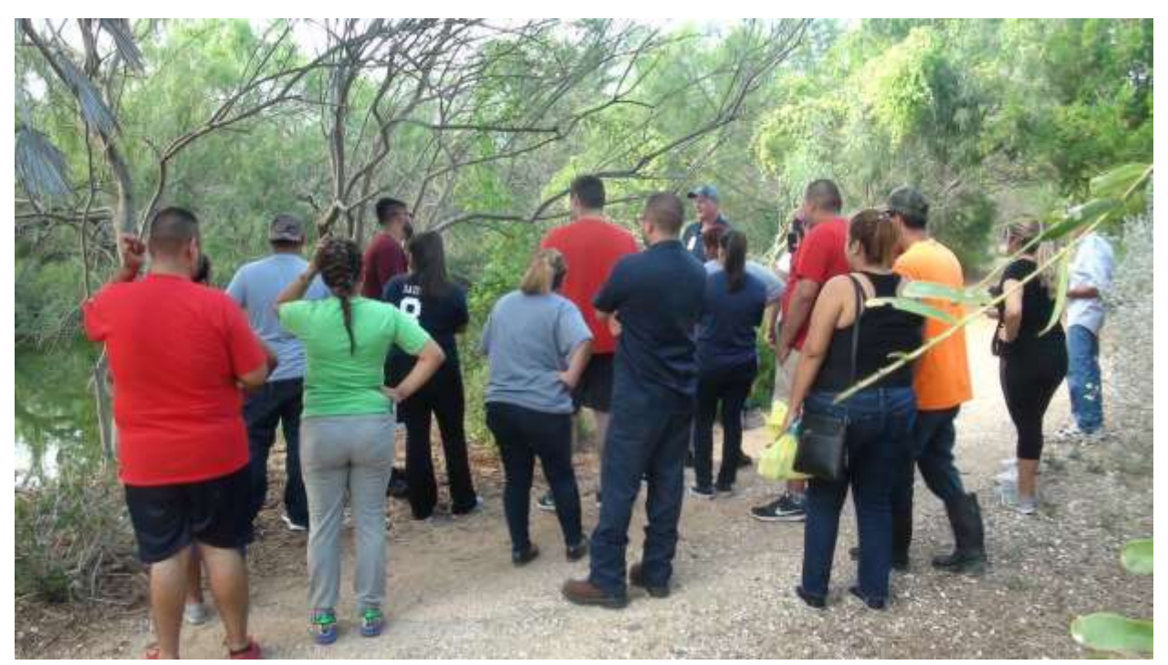
Students at pond #1