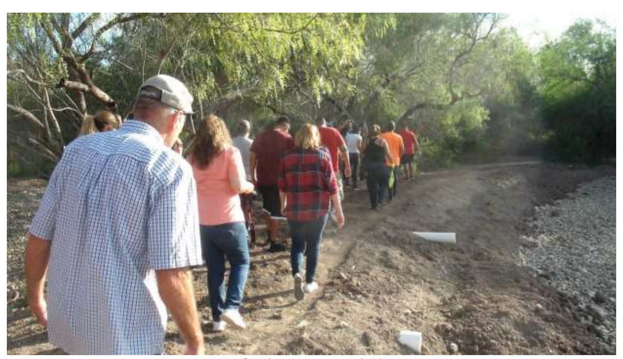
On the way to pond #4