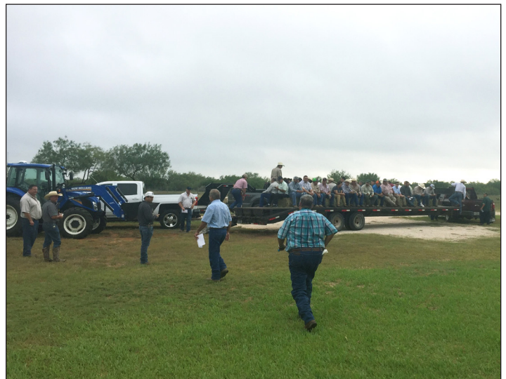
Attendees at the Rio Grande Valley Brush and Forage Management Field Day at the San Luis Ranch.

The project team hosted six workshops covering a number of topics ranging from livestock management, fruit production and preparation of products for sale at local and state farmer’s markets along with a value-added workshop demonstrating other avenues for crop commodities. (see Trainings, field days on page 6 )