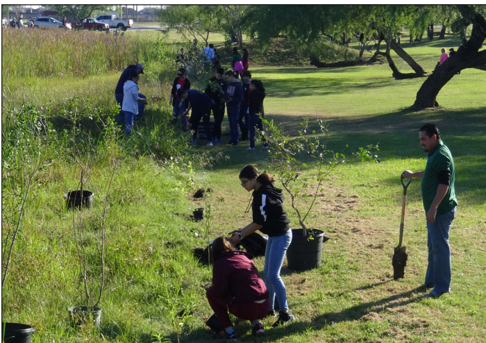
Los Fresnos High School students planting flowers, shrubs and trees at Falcon Pond Beautification Day.