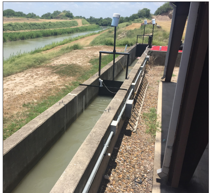
Water level sensor and automated gates in the demonstration channel at the Rio Grande Center for Ag Water Efficiency.