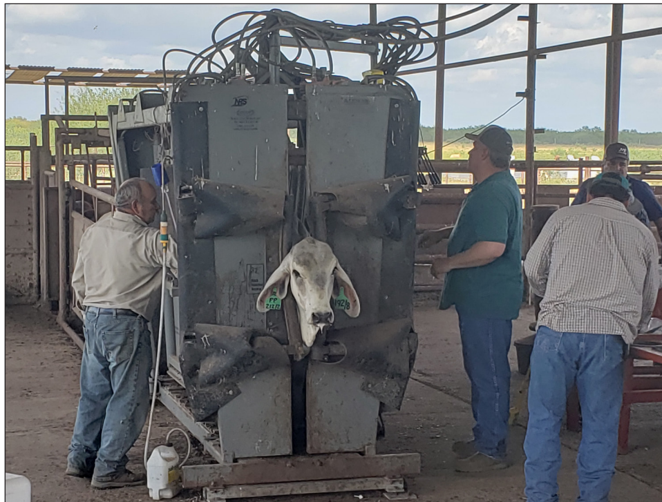
Beef Improvement Association's Bull Gain Test and Heifer Development Program conducted by Texas A&M AgriLife Extension Service to assist cattlemen in improving the quality of their livestock by collecting performance data.