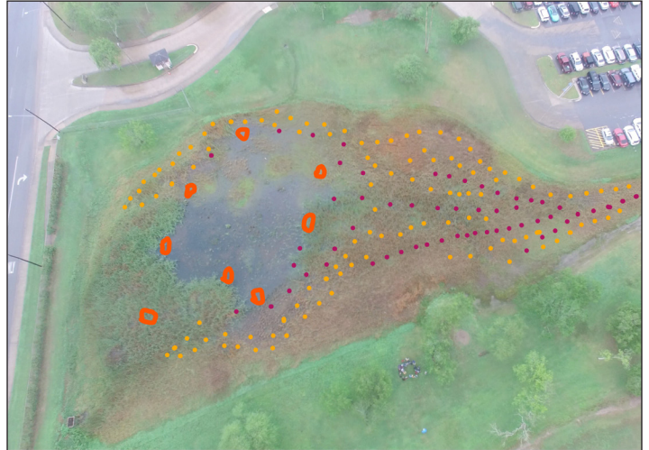
Aerial photo marking where volunteers planted flowers, shrubs and trees during the Falcon Pond Beautification Day.

Falcon Pond is the bed of an abandoned resaca, an ancient distributary channel of the Rio Grande, modified to serve as