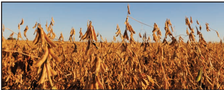
Soybeans ready for harvesting

yielding beans, the reel axle may need to be moved directly over the cutter bar. Reel bats should leave beans just as they are cut. Reel height should be just low enough to control the beans.