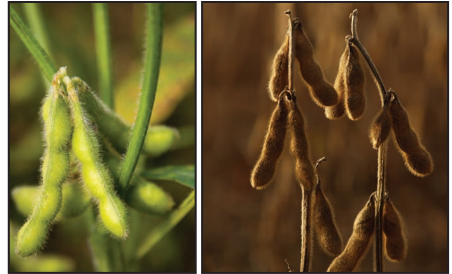
Green soybeans and soybeans ready for harvest

At the end of the season when the plant is mature, the ideal situation is simultaneous leaf and pod yellowing. However, in some situations leaves may remain green after the pods have reached maturity. Leaves and stems remaining green after the seed and pod mature can interfere with harvest.