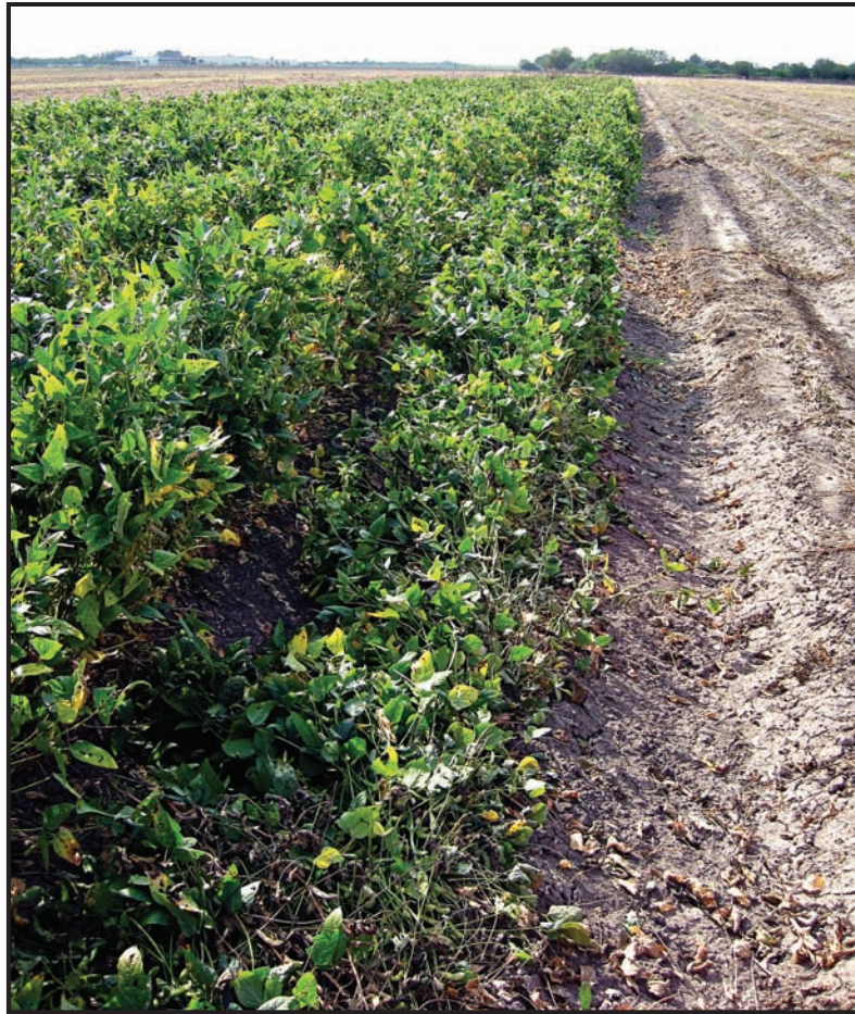
Soybean plants in the Rio Grande Valley