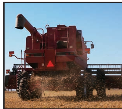
A combine harvesting soybeans

When checking for field losses, an average of 4–5 beans per square foot equals about one bushel per acre loss. To obtain a good sample, soybeans in 10 square feet should be counted. Take several random samples and average them to find the average and divide the average by 50. For example, if an average of 75 beans is found within the 10 square feet, the field loss is 1.5 bushels per acre ( 75/50 = 1.5 ).