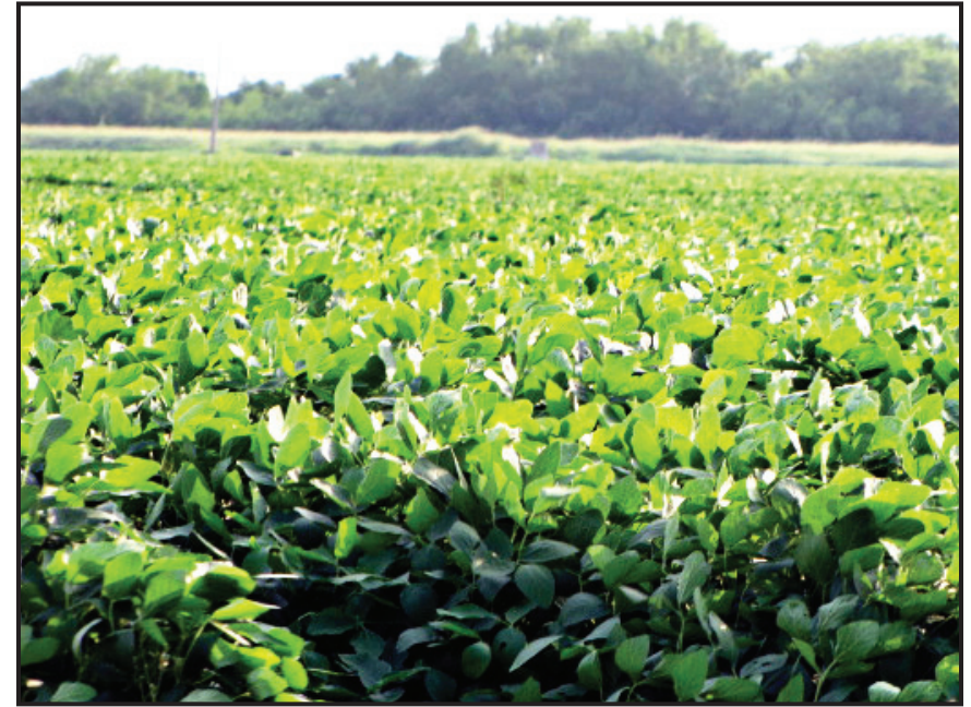
Soybean plants in the Rio Grande Valley

Nitrogen requirements of soybeans can be obtained from the atmosphere. They accomplish this with the aid of the bacteria Rhizobium japonicum . These bacteria use soybean roots as a livable environment to complete their life cycles. They form nodules on soybean roots to secure a better environment and to protect themselves from predators. They capture nitrogen from the atmosphere and fix it in a usable form. When cut with a knife, productive nodules are pink inside while non-fixing nodules will appear greenish to gray or white. The Rhizobium japonicum bacteria will use available soil nitrogen before fixing their own from the soil atmosphere. Many tests have been conducted to determine if nitrogen