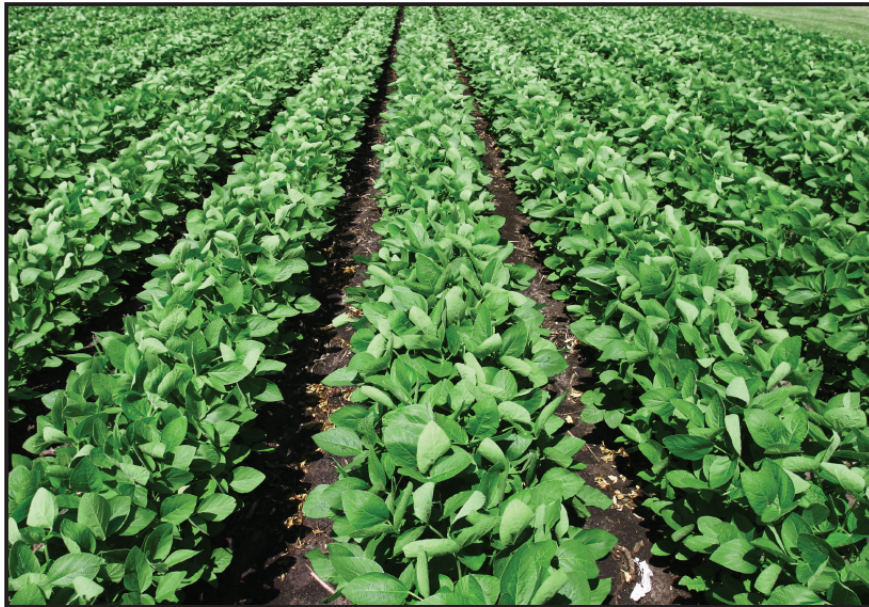
Rows of soybean plants

Soybeans planted in a row spacing of 30 inches or less will often show a yield increase over soybeans that are planted on 38–40 inches, but this yield increase is not always consistent over years and/or environments. Reduced or narrow row spacings affect the growth habit of the soybean plant similar to reduced plant populations on wide row spacings. Pod height may be lower and lateral branch length may increase when row width is greatly reduced. Harvest loss may be reduced on narrow or broadcast soybeans by increasing the plant population 25–50% over that used on conventional row spacings.